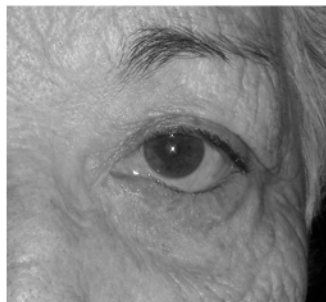
(a) Entropion of the lower eyelid is characterized by an inward turning of the lid margin.

Surgery to repair entropion is usually performed as an outpatient surgical procedure. Surgical treatments for entropion most often involve shortening or tightening the lower eyelid attachments through an incision at the outer corner of the eye, combined with some procedure to stabilize the lower lid in the normal position. Occasionally, the incision at the outer corner of the eyelid must be extended across the lower lid, beneath the lashes, in order to repair more advanced entropion.